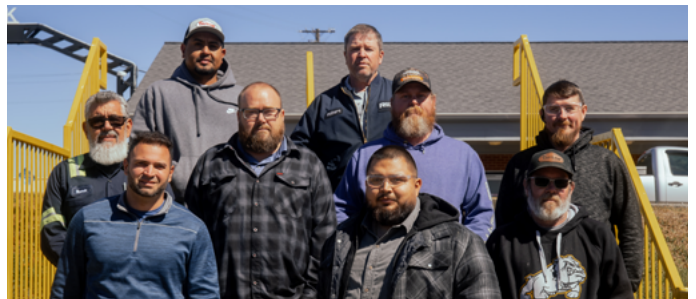
VOLVO ENGINE & VODIA DIAGNOSTICS TRAINING MARCH 3-7, 2025