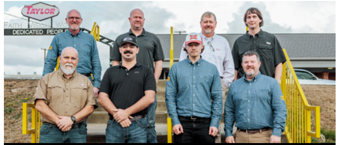
ELME ATTACHMENTS TRAINING FEBRUARY 3-6, 2025