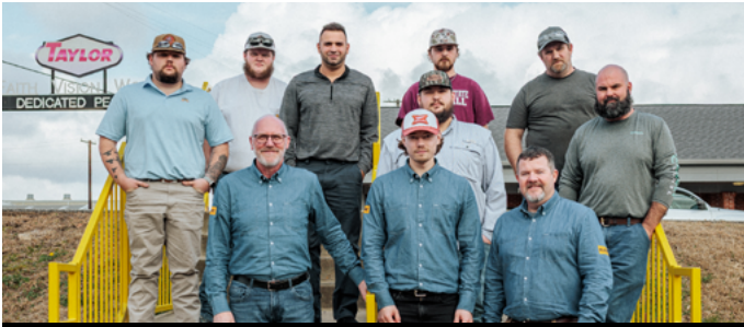
ELME ATTACHMENTS TRAINING FEBRUARY 3-6, 2025