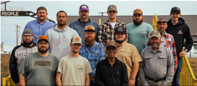
X180 - XH400L TRAINING FEBRUARY 25-27, 2025