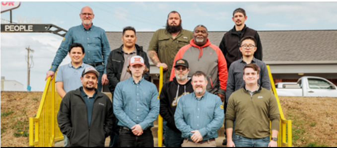
ELME ATTACHMENTS TRAINING FEBRUARY 3-6, 2025