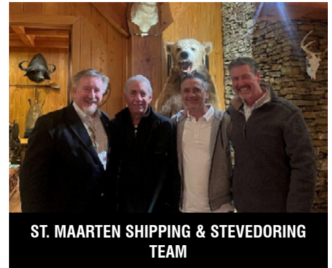
ST. MAARTEN SHIPPING & STEVEDORING TEAM

Rimac, headquartered in São Paulo, Brazil, specializes in areas such as ports, steel, naval activities, mining, transportation, and the handling of special cargo. The company represents several large foreign manufacturers. Founded in 1995, shortly after the implementation of Brazil’s Port Modernization Law— which led to the privatization of the sector—Rimac emerged to meet the growing need for new infrastructure investments.