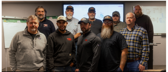
CVS TRAINING FEBRUARY 18-20, 2025