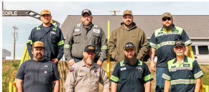
DTAC & VISION PLUS TRAINING MARCH 18-19, 2025